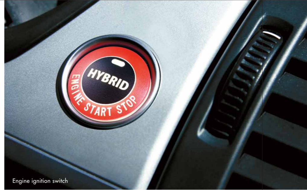
Engine ignition switch