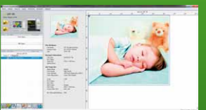
RIP & PRINT MANAGEMENT SOFTWARE Roland VersaWorks®

The LEF-20 includes Roland VersaWorks® software, which features an intuitive interface for easy operation and job management. Roland VersaWorks® allows the user to choose from two print modes, generic mode for printing fine detail, and distance mode for printing on curved surfaces. Variable data printing is also available, making it easy to personalize printed objects with serial numbers and names.