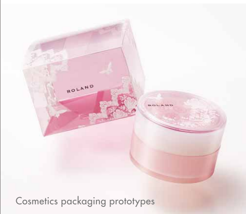
Cosmetics packaging prototypes